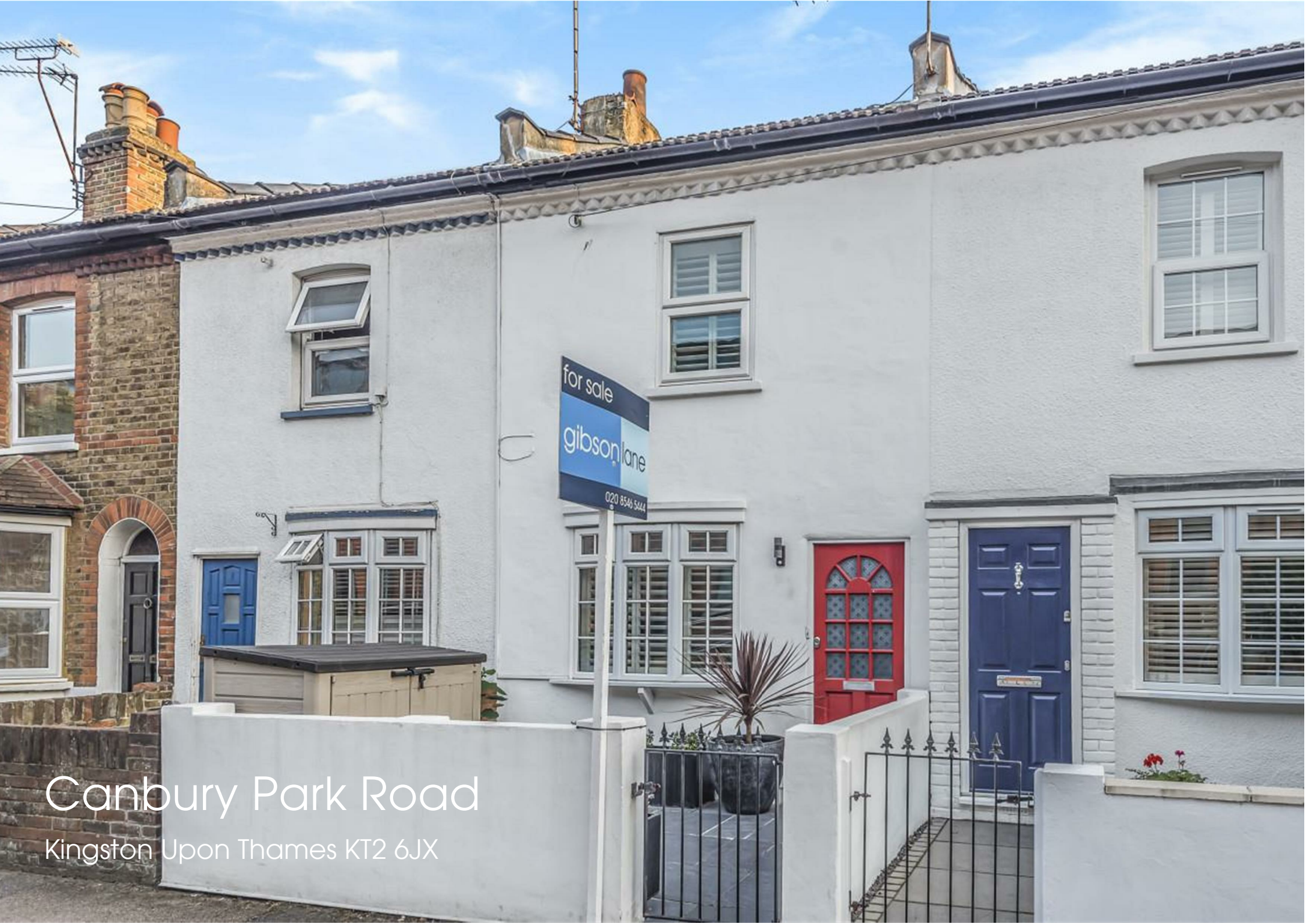
Canbury Park Road Kingston Upon Thames KT2 6JX